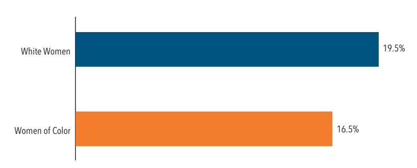
FIGURE 3 Percentage of Women in California Who Own a Business, 2012

Note: Women include civilians age 18 and older who are in the labor force. Businesses include firms with and without employees.